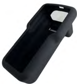
Rubber Boot/Stand for Series 4 Meters