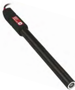
Fluoride Combination ISE