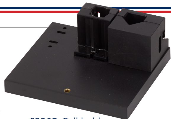
6320D Cell holder