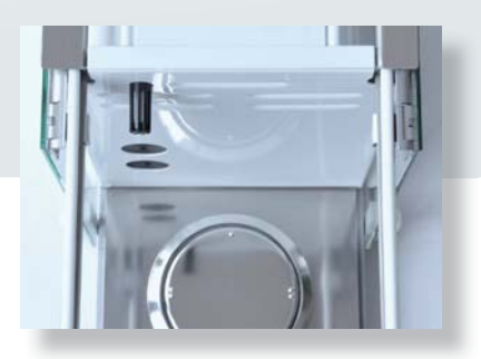
AOS Ambient Observation System

Retrofit installation of an ECS is possible by a local Precisa engineer.