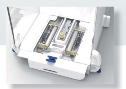
SLS Self Linearization System

Is an innovative linearization and adjustment system, meaning you will always have a perfectly adjusted weighing scale at three main points, zero, 50% and 100%. The system operates automatically and detects all changes in the environment - and it can be activated manually at any time.