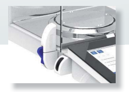
TLS Touchless Sensors

are very helpful, when you perform daily routines with your balances, like opening a draft shield door, taring or zeroing the balance or performing a special function. You can set the built-in touchless sensors to activate those functions by a simple hand motion.