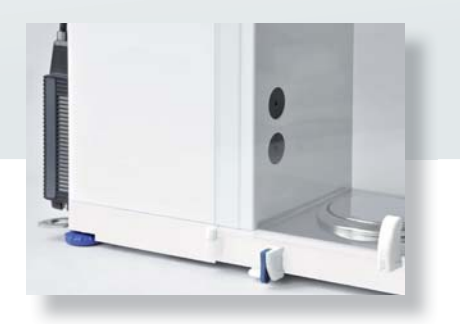
ECS Electrostatic Cancellation System

It is possible to upgrade balances which are not fitted with this feature at later stage.