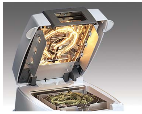
3 different heat sources are optional