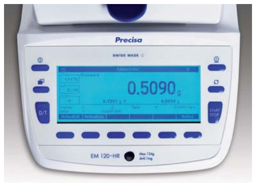
Outstanding graphic Display