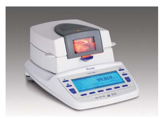
Compactly styled design