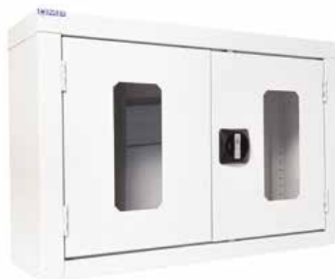
Wall Mounted Cupboard Unit