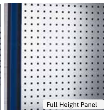
Full Height Panel