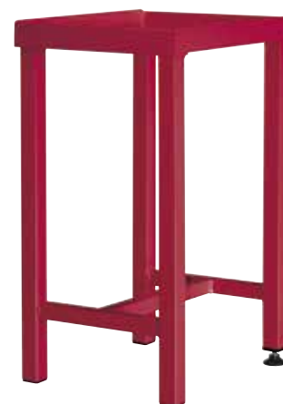
Stand with adjustable foot for uneven surfaces.