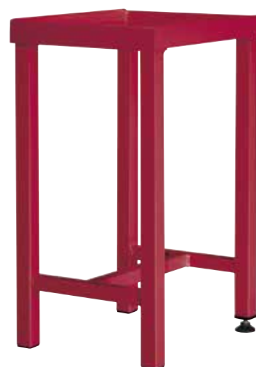
Stand with adjustable foot for uneven surfaces.