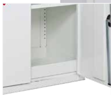
Liquid Tight Sump Included

Use of caustic materials in the workplace can present many hazards, particularly if acids and alkalis are stored incorrectly or with other chemicals. These storage cabinets enable safe and identifiable storage in the workplace.