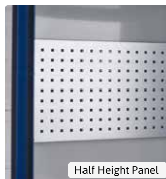
Half Height Panel